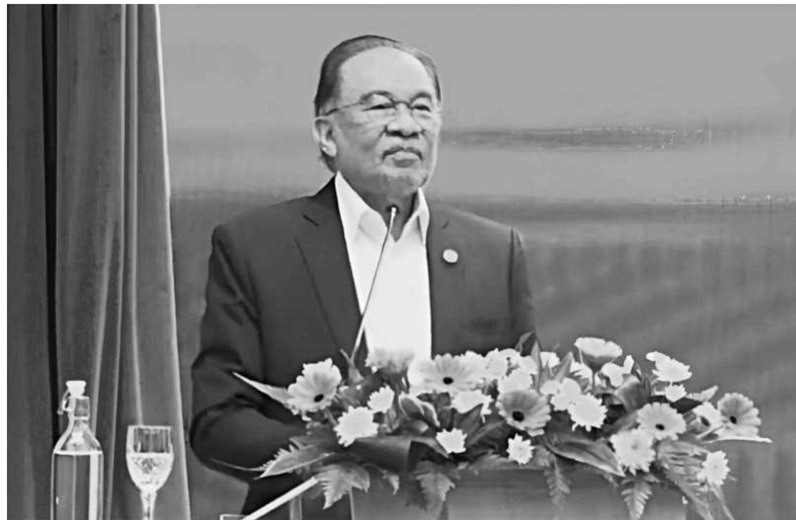
iPayment designed for use by federal government agencies that have not yet implemented an electronic receipt system to manage payments from the public - February 12, 2025

Updated 1 day ago · Published on 12 Feb 2025 10:42AM